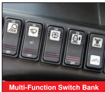
Multi-Function Switch Bank