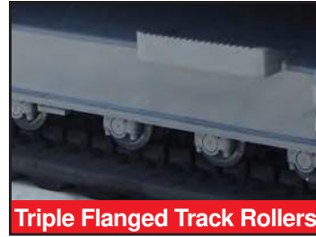
Triple Flanged Track Rollers