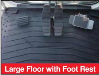
Large Floor with Foot Rest