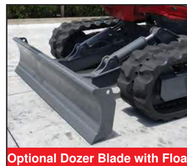
Optional Dozer Blade with Float