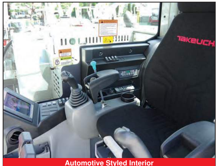
Automotive Styled Interior

*Functions may not be available in all countries, so please consult your Takeuchi dealer for details.