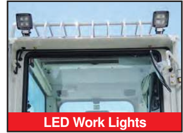
LED Work Lights

The new TB2150 hydraulic excavator delivers greater functionality, performance, comfort, and serviceability.