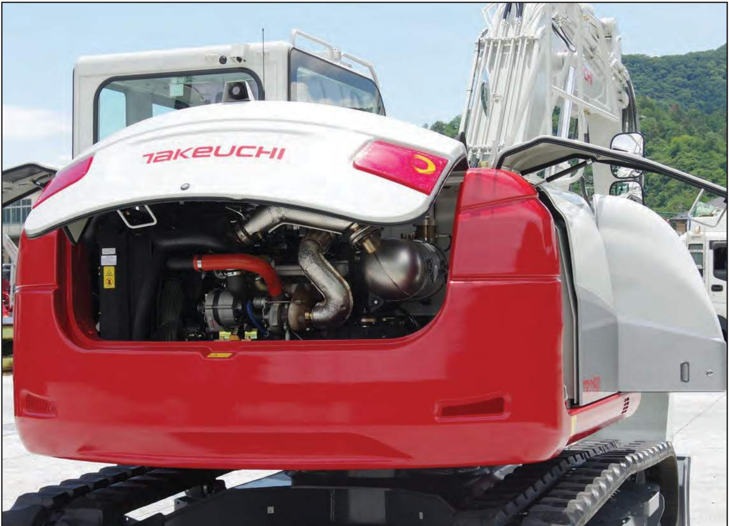
Large lockable service hood provide vandalism protection and outstanding maintenance access.

Additional features include up to four auxiliary hydraulic circuits for greater attachment versatility, boom and arm holding valves for added protection, and a large wrap around counterweight for stability.