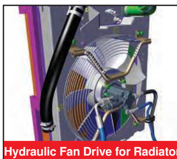
Hydraulic Fan Drive for Radiator