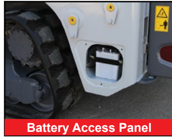
Battery Access Panel