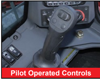
Pilot Operated Controls