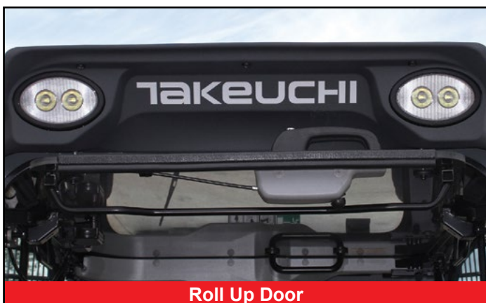
Roll Up Door