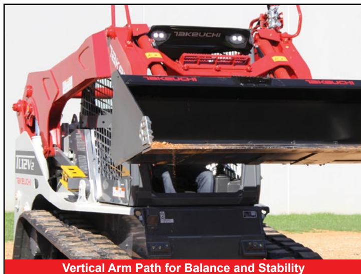
Vertical Arm Path for Balance and Stability

*Functions may not be available in all countries, so please consult your Takeuchi dealer for details.