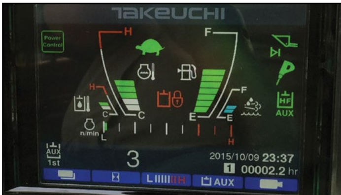
5.7" Color Display with Rear View Camera