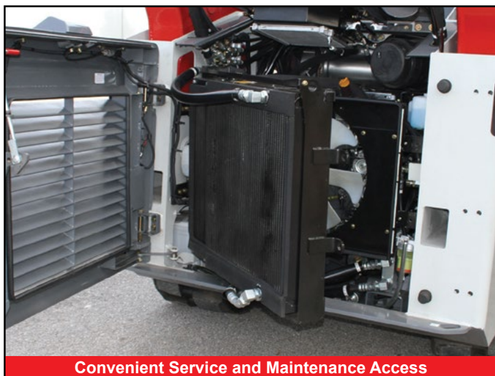
Convenient Service and Maintenance Access