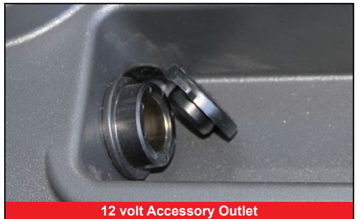
12 volt Accessory Outlet