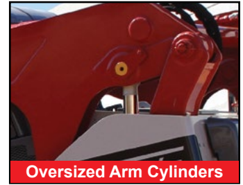
Oversized Arm Cylinders

Takeuchi's first vertical lift compact track loader, the TL12V-2 demonstrates a continuous commitment to product improvement and innovation. It is the largest and most capable track loader available today and delivers best in class rated operating capacity (ROC), a completely redesigned operator's station that features a color multi-information display with rear view camera, convenient rocker switches to control a wide range of functions, and an updated undercarriage design that enhances operator comfort by reducing vibration and noise levels.