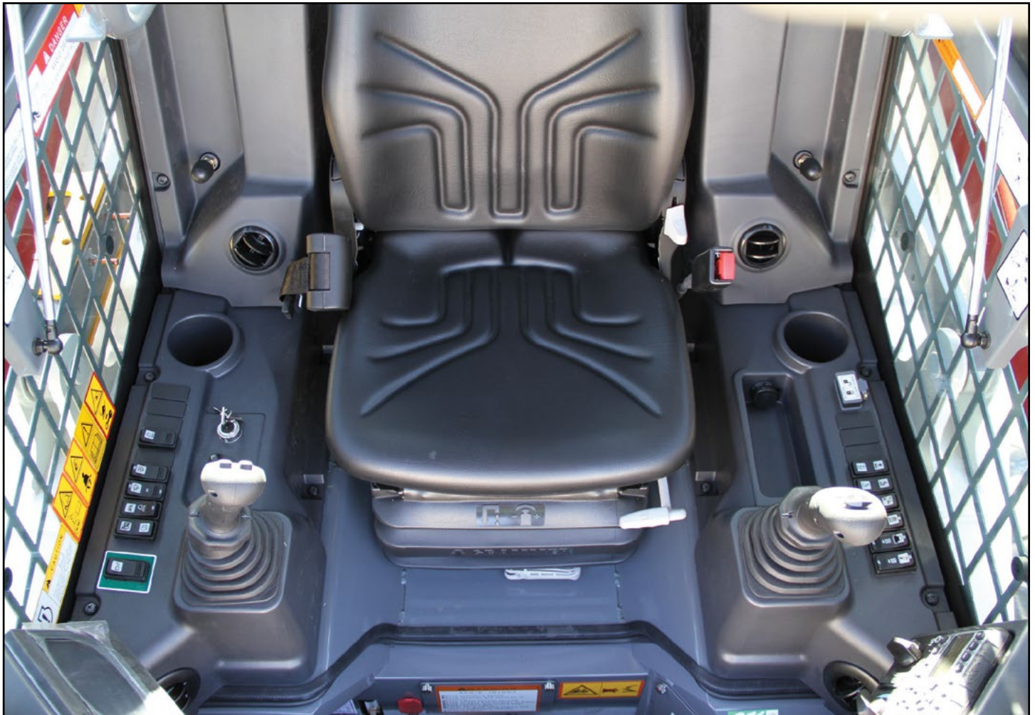
Spacious Operator's Station with Easy to Reach Controls and Switches

Performance features include massive loader arms, oversized arm cylinders and pins, rear bumper with integrated tie downs, high capacity cooling module, and LED lights on the front and rear of the machine. The TL12V-2's interior includes an updated overhead door design, redesigned foot throttle, precision pilot controls, backlit rocker switches, convenient cup holders, and a deluxe high back suspension seat for those long hours on the jobsite.